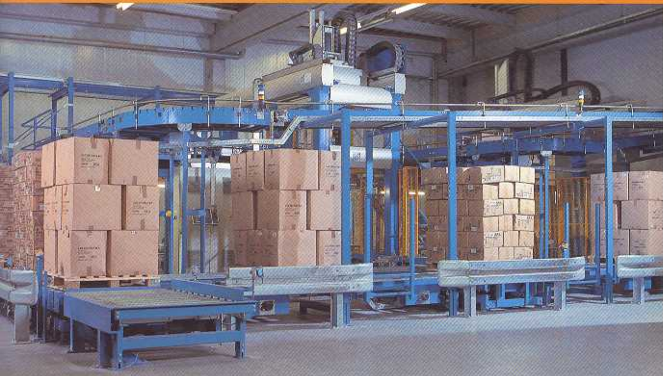
Palletizing of the cartons

After the check-in procedure, each carton is allocated an individual barcode label and is then scanned and palletized, and the associated information is relayed to the WMS (warehouse management system). During the further handling steps, the information is used for identification, specification of the warehouse location, retrieval, sorting and picking. The palletizer generates the optimum stacking pattern automatically and without manual intervention. For automatic control, the palletizers are