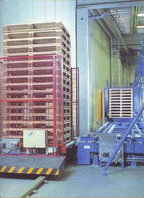
Pallet sorting unit